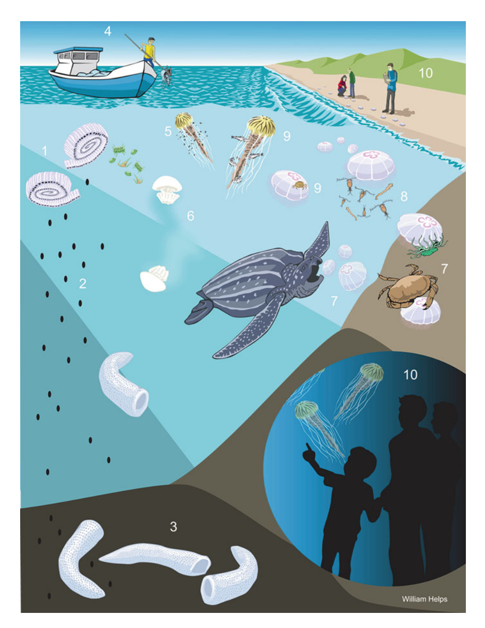
Fig. 5.1 The ecosystem services provided by jellyfish. Regulating services: (1) salps consume phytoplankton and transport carbon to the benthos via faecal pellets (2). (3) Accumulation of jellyfish carcasses (pyrosomes) on the seabed plays an important role in the transfer of carbon from surface waters to the benthos. Provisioning services: (4) jellyfish harvested for food and other uses. Supporting services: (5) sloppy feeding provide nutrients to support primary production, (6) swimming jellyfish contribute to oceanic mixing due to displacement of water as they move through it, (7) jellyfish provide a prey source for hundreds of different animals, (8) jellyfish are important predators in pelagic marine systems, and (9) jellyfish provide habitats and refugia for a large variety of taxa. Cultural services: (10) citizen science programmes encourage the public to count and identify jellyfish stranded on beaches, and jellyfish in aquaria capture the imagination of children (Scientific illustration by William Helps)